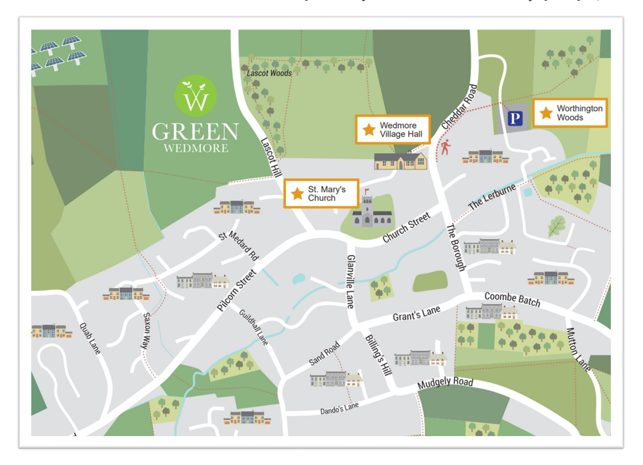
Wilder Wedmore Nature Festival 9th - 11th June 2023 - Programme of events and activities - don't forget to get your tickets!